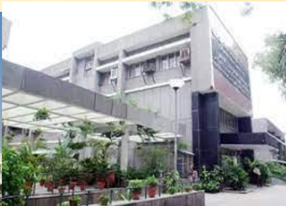
PDUNIPPD, New Delhi

(Institutes under the Department of Empowerment of PwDs (Divyangjan), Ministry of Social Justice & Empowerment, Government of India)